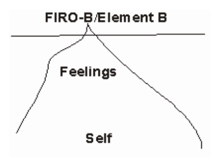
Figure 2 Iceberg Analogy

A major concern of mine is that people are left thinking that FIRO theory is primarily represented by the FIRO-B instrument and "needs" for inclusion, control and affection behaviors. This approach is inaccurate on the semantic level in that the word "need" is no longer part of the theory. It was replaced with "want." The behavioral aspect of the theory, measured by Element B, is only the tip of the iceberg. Jung said that when he observed someone's behavior he did not know what their type was because it was impossible to know what component of their psyche was actually causing the behaviors he was observing. FIRO theory says the same about behaviors. The largest and most important parts of the theory are the underlying causes of the behaviors. This is where Element F: Feelings and Element S: Self come in to play. To understand a person's behavior one must, at a minimum, understand that person's feelings, self-concept, self-esteem and fears. Just as the four-letter type code does not explain personality, neither do FIRO-B or even Element B explain FIRO theory.